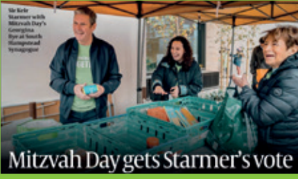
Mitzvah Day gets Starmer's vote