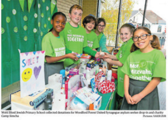
Woodford Jewish Primary School collected donations for Woodford Forest United Synagogue asylum seeker drop-in and charity Camp Simcha.

Children in Redbridge have collected toiletries for asylum seekers as part of an international day of social action. Pupils from two Jewish primary schools joined Mitzvah Day, a faith based social action event, to help their local community. Woodford Jewish Primary School (WJPS) pupils supported an asylum seeker drop-in centre run by Woodford Forest United Synagogue. The children also collected toys for Camp Simcha - a charity that supports seriously ill children - and made cards, pictures, drawings and bunting to bring cheer to residents at Jewish Care's VI and John Rubens House, which it says is the only Jewish care home in Redbridge. Along with Barkingside's Clare Tikva School pupils, the Clare Tikva school pupils, the children spent Friday, November 19 collecting and baking to help others. "Initiatives like Mitzvah Day