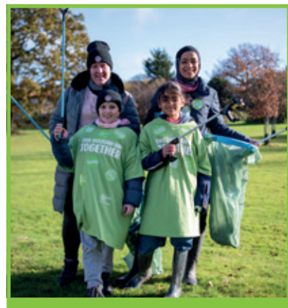
Interfaith litter pick and launch of the Children’s Climate Emergency run by food poverty charity Gratitude