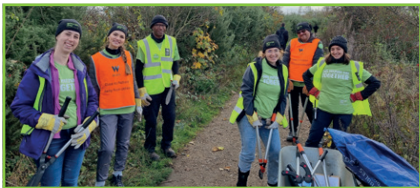
Mitzvah Day volunteers joined the London Wildlife Trust to undertake practical conservation tasks at Walthamstow Wetlands