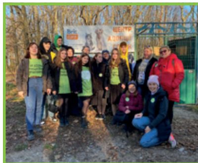
Odessa Animal Welfare Project

Previous Mitzvah Day projects had involved friendly visits to isolated seniors and collections and distribution of warm socks and winter jackets to individuals from marginalised communities.