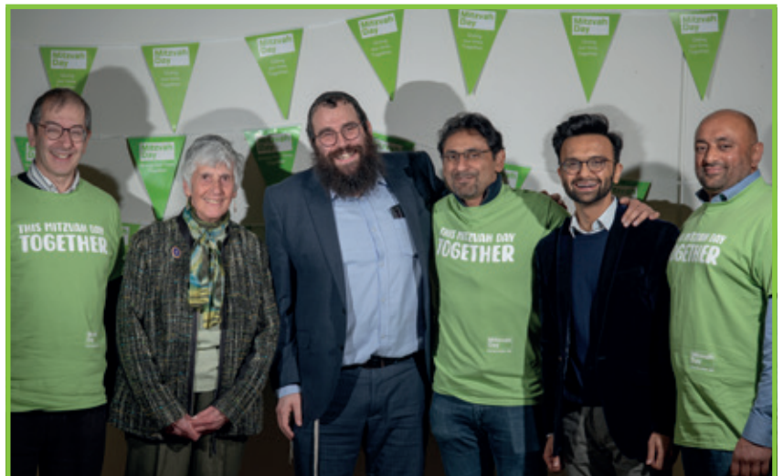
South Manchester Synagogue Interfaith Tea Party

On Mitzvah Day, communities and individuals are empowered to engage in a wide variety of social action projects, including visiting older or lonely people; collecting clothing to donate to refugees; replenishing food bank stores; cooking for homeless people and taking part in environmental projects. All these projects facilitate genuine connections between communities, individuals and the charities they support, using social action as the way to connect.