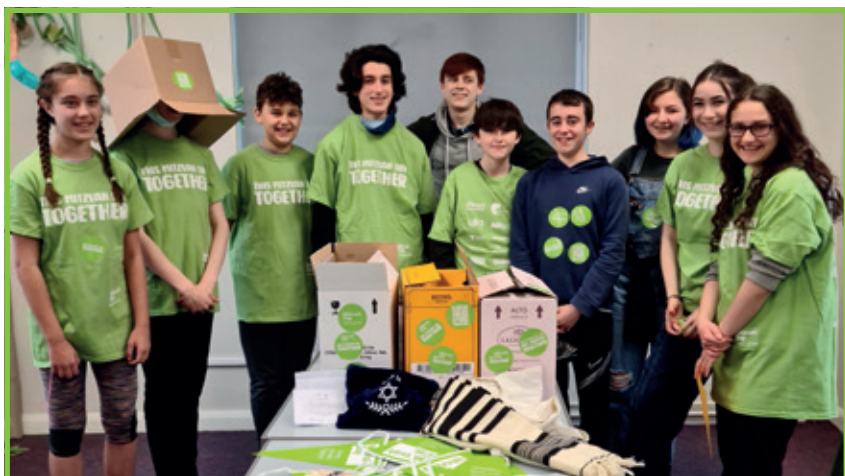
Ark Synagogue's KT class collected Judaica to support families in Belarus and wrote letters in Cyrillic script