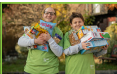
Whitefield Hebrew Congregation Food Collection

The Mitzvah Day Trustees for their unwavering support and commitment to ensuring our stability and sustainability.