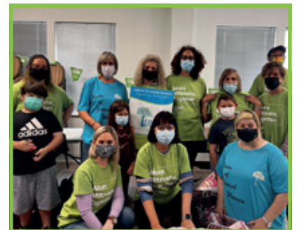
UJW Johannesburg collection project