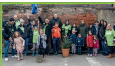
The Liberal Synagogue Elstree made bird feeders and planted a tree to improve their environment