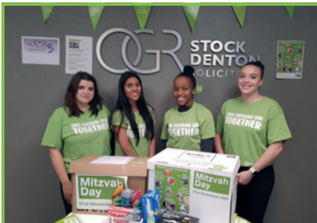
OGR Stock Denton collected toiletries for child refugees via The Separated Child Foundation

We were delighted to be able to reconnect with people and communities from all faiths and backgrounds, many of whom had not been able to come together due to Coronavirus. Not only were we able to re-establish old connections but we were able to create and facilitate new ones including an exciting relationship with the Coptic Church which we look forward to building upon and developing further. Bringing together communities and groups that are on one another’s doorsteps but not yet working in tandem is one of our favourite things about Mitzvah Day!