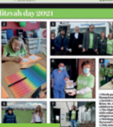
Mitzvah day 2021