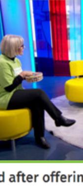
Business praised after offering...