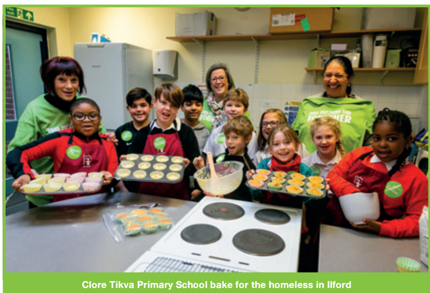
Clore Tikva Primary School bake for the homeless in Ilford