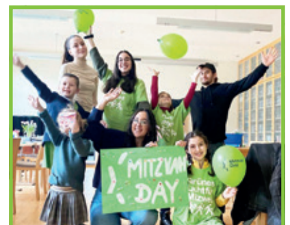
Mitzvah Day Germany

For 2021 they repeated these projects with a particular focus on connecting with smaller social service organisations that work directly with at-risk people and supporting grassroots organisations.