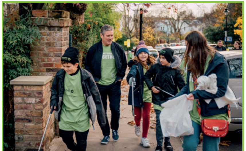
Sir Keir Starmer on a litter picking adventure!