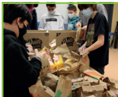
National Council, Winnipeg