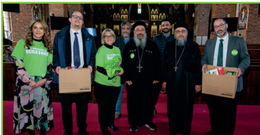
Alyth Synagogue and St Mary & Archangel Michael Coptic Orthodox Church food bank collection