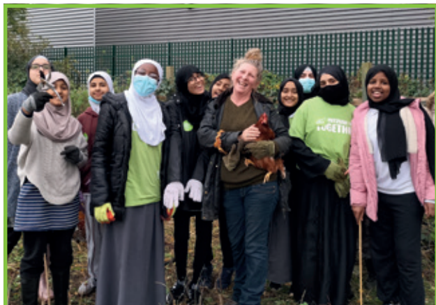
Lady Nafisa (Muslim) School students helping out in the local community allotments